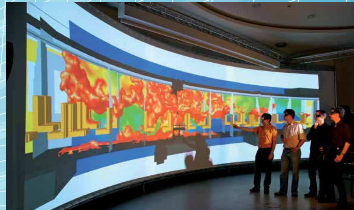
Figure 2: Simulation of fire propagation in a train compartment. Shown is a three dimensional representation of the flame distribution.

Along with interesting self-organization phenomena there is a multitude of applications, like the evaluation of escape routes in the context of crowd management or the optimization of pedestrian