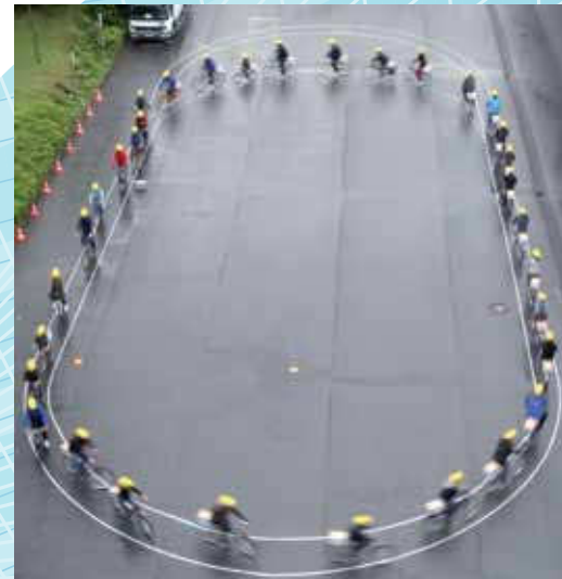
Figure 3: Left: mixed and dense traffic involving pedestrians, vehicles and cyclists in the city of Kolkata (India). Right: experiment with bicyclists performed in Wuppertal (Germany). The extraction and analysis of trajectories will give new insights into the development of bicycle traffic models.