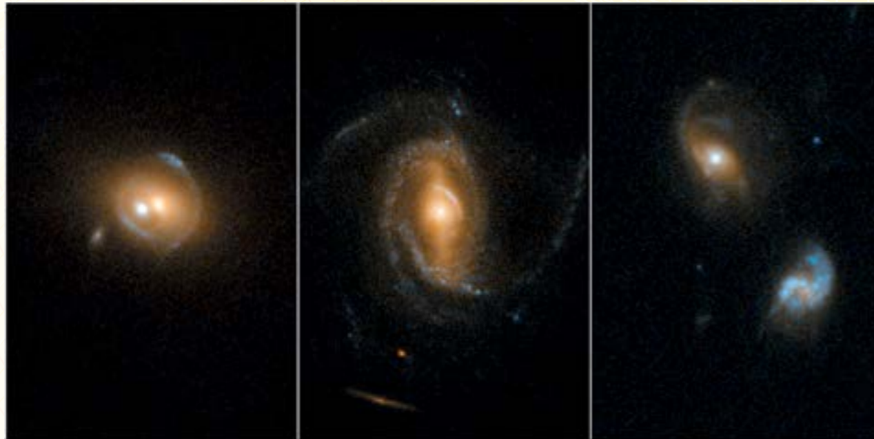
Figure 3. A galaxy-quasar combination found using the Sloan Digital Sky Survey.