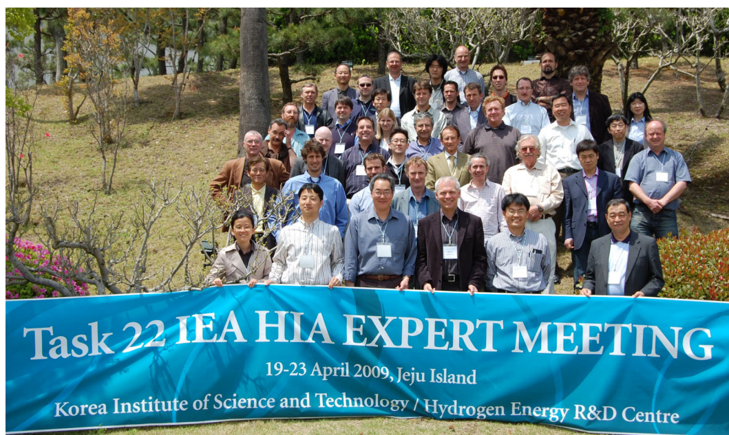
Figure 2: Participants at the Task 22 IEA HIA Experts Meeting in Jeju Island, Korea in April 2009.

Task 22 of IEA HIA addresses hydrogen storage in solid materials. The research efforts related to development of materials for use in vehicles will require new materials and solutions, and not simple, incremental improvements in current technologies. Phase 1 of Task 22 ended in December 2009 after 3 years and phase 2 has started for a new 3-years period.