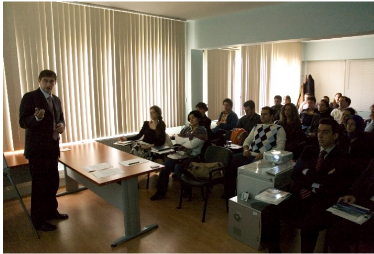
Figure 2: Students following a lecture in one of the short courses.

Engineers were given every opportunity to participate national and international activities. Several conferences were attended as presenter or participant. ICHET exhibited at several exhibitions and engineers were allowed to participate to learn about state of the technology in various geographic locations.