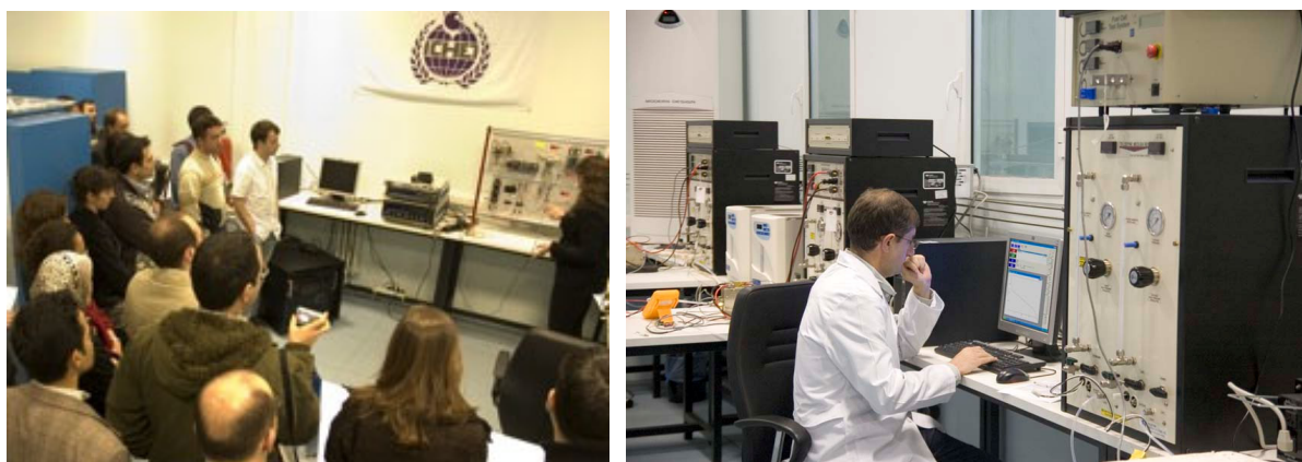
Figure 4: Scenes from ICHET laboratory activities.

towards their degrees. Since 2005, more than 70 students have been supported under this program. In the past ICHET has received visiting scientists from other institutions. ICHET had post-doctoral stays from India, Pakistan (2), Iraq, Germany, USA, Egypt and Turkey (2). ICHET has organized several training seminars about basic technology and research topics as well as analytical equipment use. "Fuel cell integration", "Fuel cell fundamentals, engineering and applications" and "Tools for the Characterization of Materials for Energy Applications" are some to mention with wide spectrum of coverage. Each training activity accepted around 40 participants from universities, companies and government. These trainings provided theoretical background on first day and laboratory experience on the second. Extensive use of the Centre's laboratory facilities and demonstration of the project vehicles were useful in providing real hands-on experience to the participants (Fig. 4). State of the art laboratories include several a few watt to 12 kW test stations, electrolyzers (500 cc/min to 1 m 3 /hr), various hydrogen storage options, analytical instruments such as gas adsorption analyzer, surface area and porosimetry, TGA-DSC and others.