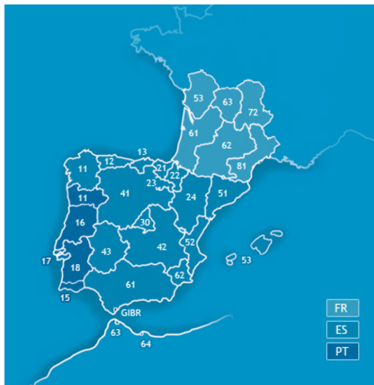
Figure 1: SUDOE regions.

The idea of developing a specific roadmap for SUDOE has its origin in the HyWays project. HyWays was an integrated project co-funded by research institutes, industry and the European Commission under the 6 th framework programme that carried out a road mapping exercise to integrate hydrogen technologies into the European energy system. HyWays used a 'hybrid' methodology: it integrated extensive quantitative computational modelling as well as qualitative components such as actor analysis, conducted through the KCAM methodology [1, 2], and stakeholders preferences for the validation process (see figure 2).