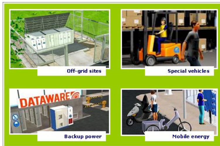
Figure 1: Overview of hydrogen early markets.