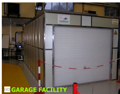
Figure 4: CEA Garage facility (source: CEA).

Background works have been performed in sealed confined configurations [2,3,4]. Within H2E projects, experiments will be performed in CEA Garage facility (see Figure 4) with a specific focus on natural ventilation (through one or two openings, with and without wind effects) and forced ventilation configurations. Another task is devoted to hydrogen dispersion through a first confinement (which is played by hydrogen objects structure) in a second confinement (i.e. the room where H 2 object is located).