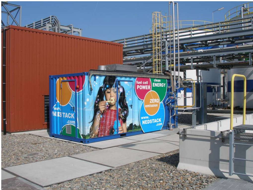
Figure 2: Container with the 50 kW PEM Power unit at the Akzo Nobel chlor-alkali plant in Delfzijl.