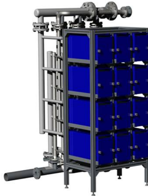
Figure 1: Module with 12 stacks, with 75 cells each and an effective cell area of 200 cm 2 .

At the stationary load of 50 kW a total of 12 stacks (figure 1), comprising 900 cells, is connected in series, generating 630 VDC at 80 A. At this operating point of 0.4 A/cm 2 the nominal stack power is 4.2 kW, while the rated peak power is 10 kW at 250 A. An inverter connected to the local grid converts the direct voltage to 400 VAC, 3 phase. Although an electrolysis plant uses direct power it turns out to be more economical to feed to the grid rather than to the electrolysers. The conversion efficiency of the fuel cells is 55 %. The balance of plant, including the inverter, reduces the overall efficiency to 45 % (LHV of hydrogen). The Pilot PEM Power Plant is located in a 20 foot sea container at the chlor-alkali plant Delfzijl (figure 2). More information is in ref 2-4.