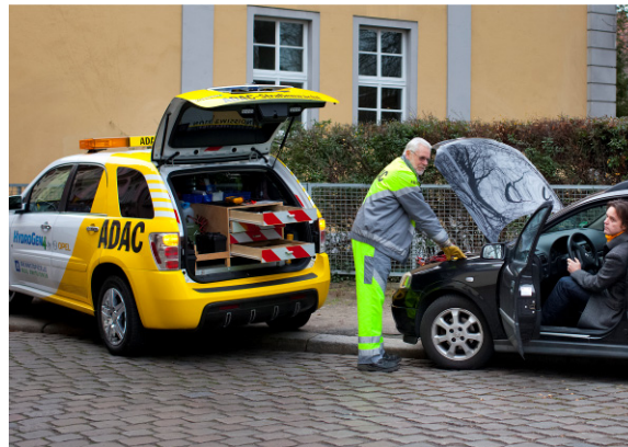
Figure 3: Berlin road patrol HydroGen4.

For refuelling, there is a fuel station with 700-bar technology at Berlin-Spandau. This is the first commercial fuel station world-wide equipped with an infrared vehicle-to-station data communication interface. The interface communicates the data relevant to the recharging process (such as temperature and pressure) as well as the recorded driving and operating cycle and fuel consumption data directly to Opel. With the technology developed for this station, refuelling does not take longer than conventional filling up. Two other fuel stations are not equipped with the 700-bar technology, which renders refuelling considerably longer.