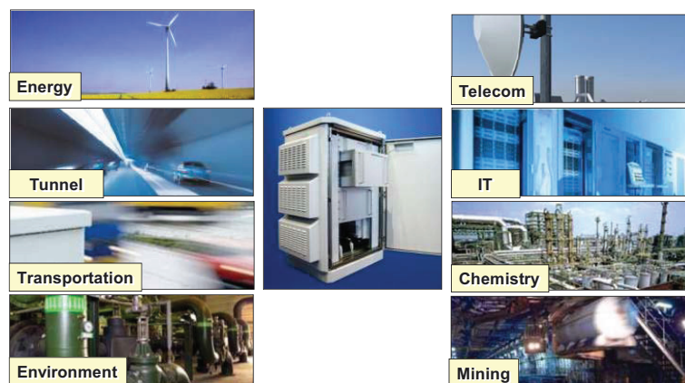
Figure 3: Fuel cells in critical power supply/ back-up power.

Before new technologies capture mass markets, they are often used in special applications that can showcase their merits particularly well. Under the NIP, this area is known as »Special Markets«. Fuel cell applications in these special markets stand out because of their greater proximity to market readiness compared to other application areas, their highly diverse applications — from micro fuel cells and critical power supply, to leisure and camping products — as well as a multitude of innovation-focused small to medium sized businesses involved. Critical power supply in various applications and industry fields (see Figure 2), conveyor technology, and vehicles such as forklifts and airport tow tractors, electric light vehicles like cargo bikes and boats, onboard power supply for the leisure and camping market, as well as small applications such as power supply for RFID systems (Radio Frequency Identification in logistics) on the basis of micro fuel cells, are just some of the diverse areas where this technology can be applied.