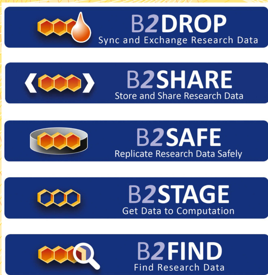
Figure 2: EUDAT service suite

B2SAFE is a robust, safe and highly available service that allows community repositories to implement data management policies on their research data and replicate data