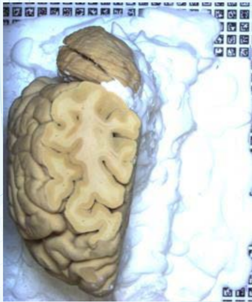
Figure 3: Brain tissue cutted with 80 micrometer into ~700 layers available as block face images.

As shown in Figure 1, currently four data innovation communities (DICs) are using the platform in different topical areas that offer domain-specific data sources for distinct research projects. Interested organizations from industry and academia are welcome to participate in one of the following four topical areas but are particularly encouraged to participate with ready available data, good analytics algorithms, or interesting research questions.