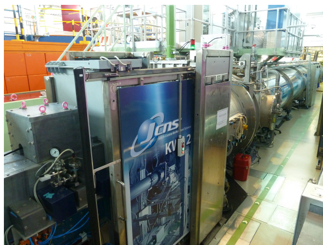
Figure 1: Instrument KWS-2.