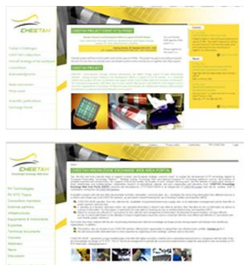
Figure 1: FP7-CHEETAH project web site ( http://www.cheetah-project.eu ) and CHEETAH Knowledge Exchange Area Portal (KEAP) web site ( http://www.cheetah-exchange.eu )

It is also based on the utilization of structured cataloguing criteria applied to PV technologies/PV RTD topics and CHEETAH involved organizations.