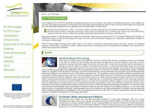
Figure 3 - PV RTD TECHNOLOGIES web page http://www.cheetah-exchange.eu/pv_technologies.asp

The CHEETAH Knowledge Exchange portal uses them as the base to catalogue the offer/demand among consortium partners of requested expertise, infrastructures, equipment, courses, technical documents, by promoting further development of knowledge in the same field of interest also outside of the consortium.