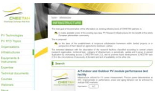
Figure 5 - CHEETAH Infrastructures web pages http://www.cheetah-exchange.eu/infrastructure.asp

The extended database with the description of CHEETAH experts is available to comment/interact on a wide range of PV RTD topics.