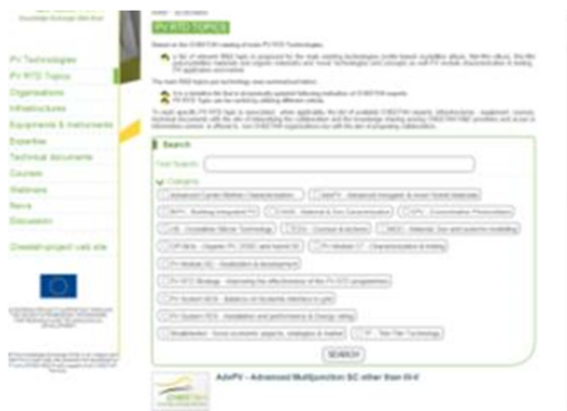
Figure 4: PV RTD TOPICS web page http://www.cheetah-exchange.eu/tags.asp

It is a tentative list that is dynamically updated following the indication of CHEETAH experts. The PV RTD Topic can be sorted by utilizing different criteria. To each specific PV RTD topic is associated, when applicable, the list of available CHEETAH experts, infrastructures, equipment, courses, technical documents with the aim of intensifying the collaboration and the knowledge sharing among CHEETAH R&D providers.