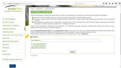
Figure 6. CHEETAH External partners web Log-in area

Access to CHEETAH KEAP is offered by a registration procedure by user name (email) /password. Three different access right levels are arranged depending on the project necessities to access to the information content. The registration procedure offers also the opportunity to collect statistic data (role, gender, nationality, etc) on registered users and the procedure includes also the opportunity to recover forgotten passwords.