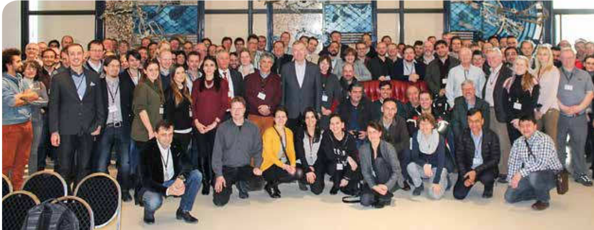
PRACE collaborators at the PRACE-5IP Kick-off.