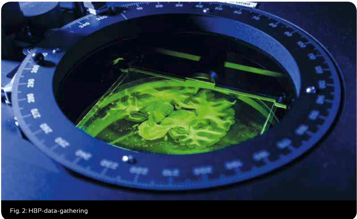
Fig. 2: HBP-data-gathering

Jülich and the Swiss National Supercomputing Centre in Lugano (CSCS)—plays a crucial role in the HBP RI. The mission of the HPAC Platform is to provide the basic data and computing infrastructure that enables scientists to store their data, integrate it into models, use it in simulations, as well as to analyze and visualize it. The participating centers BSC, Cineca, CSCS, JSC and, starting with the third phase of HBP, the TGCC of CEA in France are jointly developing the infrastructure in co-design with early adopters from the HBP community. Including CEA, tier-0 HPC systems of all five PRACE hosting members are now integrated into the HPAC Platform and available to HBP scientists for their research. The five centers are also working closely together to develop the federated Fenix