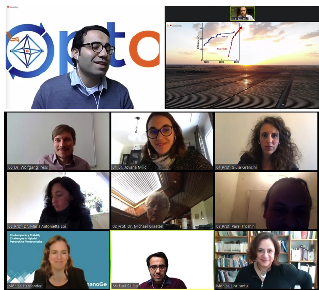
Figure 2. Impressions from the nanoGe Online Meetups and the ViPerCon. Image Credit: @nanoGe_Conf. 22

There has been an effort from the energy research community in this direction. In particular, the nanoGe platform has organized a new series of online meetups that gathered the photovoltaics community, 2 along with the first virtual perovskite conference (ViPerCon) that took place in April 2020, 3 jointly bringing together more than 1200 attendees worldwide over several days of online seminars (Figure 2). This provided a new stage to meet and exchange