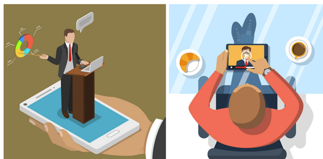
Figure 3. Online conferencing.

gatherings can take place online without compromising the quality of the scientific exchange (Figure 3). Some of the